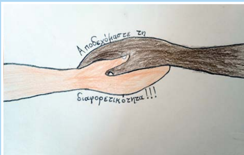
Akrivi Papadimitriou 5 th Primary School of Sparta